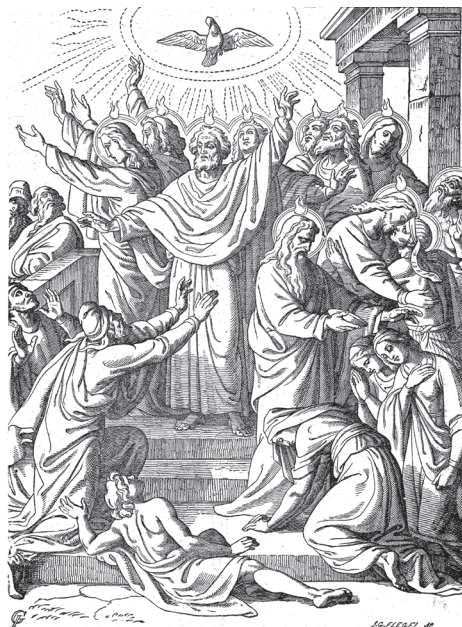
"Day of Pentecost," wood engraving by I. G. Flegel

For Israel, restoration is primarily geographical and political, but ultimately spiritual. Putting Israel back, restoring Israel, requires putting the Jews back in their land. God gave that land to Abraham and to his descendants by an