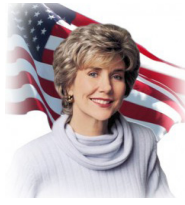
Joni Eareckson Tada Honorary Chairman

★ COLORADO SPRINGS, CO – The 60th Annual National Day of Prayer will take place Thursday, May 5, 2011. Millions will unite in prayer at thousands of events from coast to coast. The theme, “A Mighty Fortress is Our God,” is based on the verse from Psalm 91:2: “I will say to the Lord, my refuge and my fortress, my God in whom I trust.” (NDP 5/5/11)