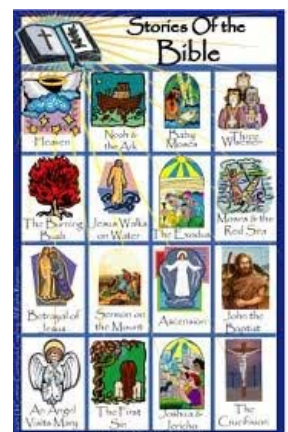
Picture: Bible Story Bingo www.uncommoncourtesy.com/BibleStoriesComplete.htm