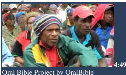
Oral Bible Project by OralBible

PRAYER/PRAISE Persian Project Update Recently, money was raised to train 40 Farsi-speaking leaders in Italy. We thank the Lord for the financial contributions and prayer. We will be traveling to Christ is the Answer Ministries on August 19th to conduct the BibleTelling training event.