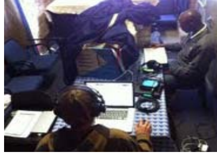
Davar Field Team, busy recording the Northern Sotho Full Bible

4.35 billion people in the world do not read. How will they engage with God's Word?