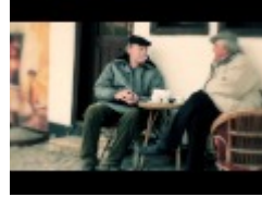
Bosnia-Herzegovina Czech Republic