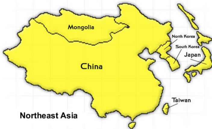
JULY – Harvest Ethne Prayer Network Northeast Asia

We continue taking a focused look in strategic prayer for specific peoples of the world who are primarily oral and are still unengaged. Linking together and following the Harvest Ethne Prayer Strategy Network 12 month calendar for unreached people groups. Our plan will be to bring the remaining people groups that Finishing the Task (FTT) is tracking into our prayer view and strategically focus on the remaining 56 UUPGs from the original 639 UUPG List of people groups with over 100,000 in population that are still in need of engagement and strategy.